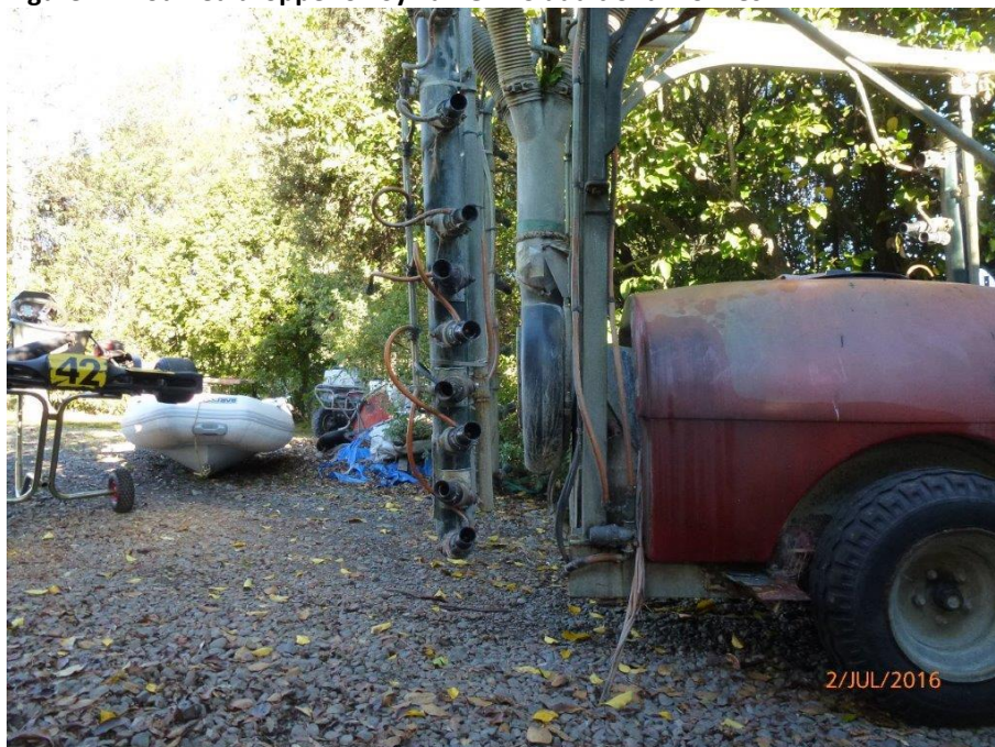
Figure 2: Modified dropper on Sylvan G2 - 3 additional nozzles

Three of the six nozzles were forward facing and three were backward facing, thus creating two areas of turbulence instead of one in the bunch zone.