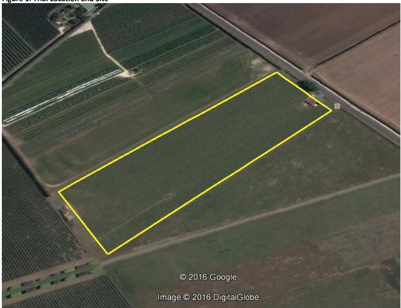
Figure 1: Trial Location and Site

Treatments were applied at 7-10 days intervals.