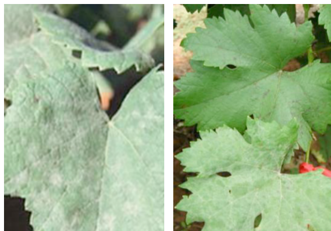
Figures 2 and 3: Powdery mildew produces ash-grey to white fungal growth over both surfaces of leaves (left & lower right). Fungicide sprays provided excellent control of powdery mildew if applied with effective coverage (top right)

As a result, the amount of powdery mildew that carries over winter has a large influence on the initial levels of disease next season. The more infected buds, the more the disease spreads in early season. This determines the ease or difficulty in controlling disease that season.