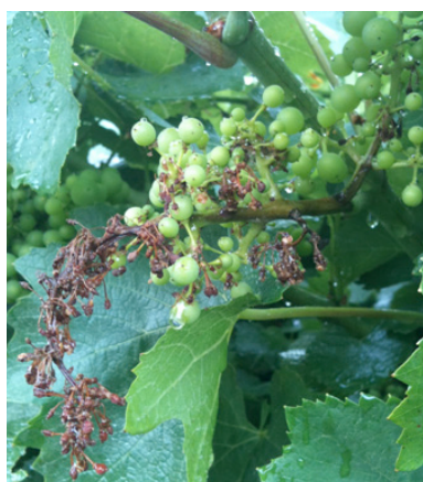
Figure 1: Downy mildew bunch infection, despite spray applications. Spray timing is critical to achieving effective control of weather-driven diseases like downy mildew and careful monitoring of weather data helped to achieve this in the very wet season 2010–11.

This year, the regular succession of rain events suitable for primary and secondary infection led to a severe test of control practices in the vineyard.