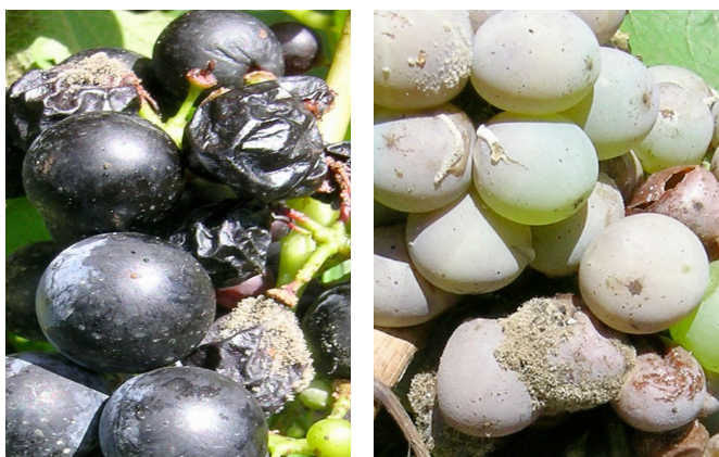
Figures 4 and 5: Botrytis bunch rot on Ruby Cabernet (left) and with other rots, including sour rot, on Riesling (right). Extended leaf wetness in warm, humid conditions during 2010–11 triggered growth of the buff-coloured fungal spores that spread bunch rot and favoured other bunch rotting organisms.

Early next season Assess the prevailing weather (especially rainfall) to determine the risk of bunch infection by Botrytis in particular. Sprays during flowering may be warranted but because the bunch rot organisms need warmth and moisture for infection, they will not be a major problem next season if the weather stays dry.